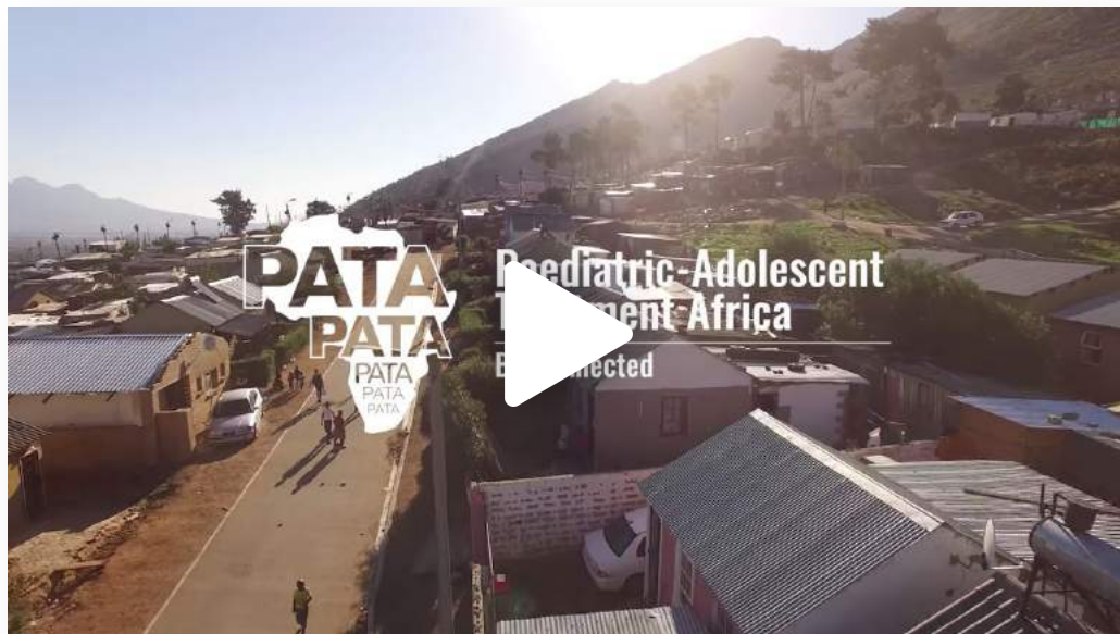
PATA: Be Connected