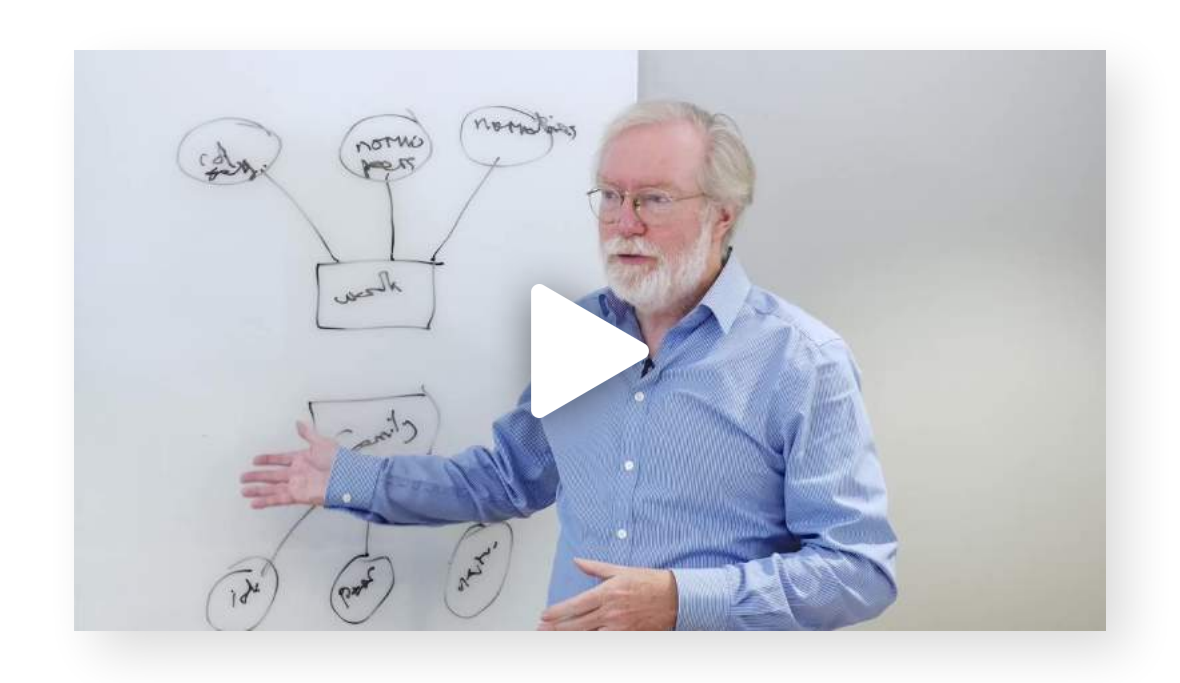
From Poverty to Prosperity: Understanding Economic Development